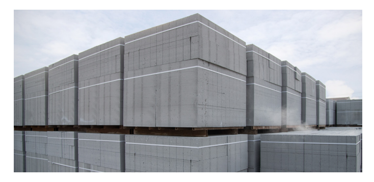
concrete, and happily there have been ways of doing that for quite a long time.

Since the vast bulk of the carbon impact of concrete comes from the production of cement, the obvious way to improve its impact is to reduce the amount of cement used in the